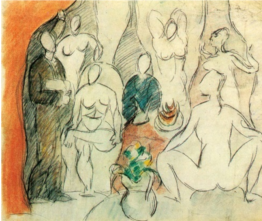
One of the sketches.

It's resemblance to the Large Bathers of Paul Cézanne.